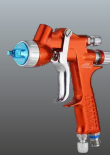
Mini Xtreme SPOT REPAIR