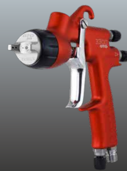
3300 GTO PRIMER