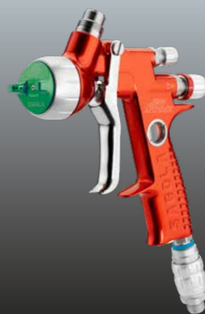
4600 Xtreme HVLP