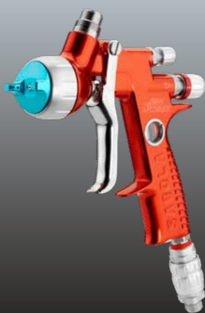
4600 Xtreme WATER