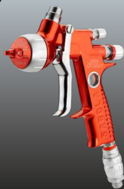
4600 Xtreme HS